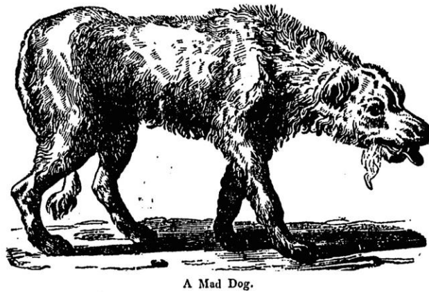
Image 2: Sketch of “Mad Dog” infected with rabies printed in The Family Magazine; or, Monthly Abstract of General Knowledge on May 1, 1840.

urbanized cities. Taken from a British report, The Family Magazine explained how a dog turned mad and revealed its symptoms. The first day of illness it turned irritable, sullen, fidgety, and plagued by distorted expressions. By the second day, it lost muscle control, seemed prone to constant movement, and excessive thirst. By the fourth, sometimes fifth day, infected dogs usually died in convulsions. 76 While the magazine reported the British were unsure if hydrophobia transmitted to humans, opinions differed amongst physicians in America.